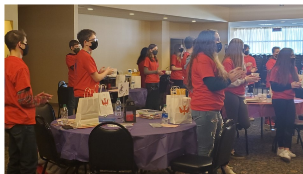
Witnesses and Singing at the Confirmation Retreat