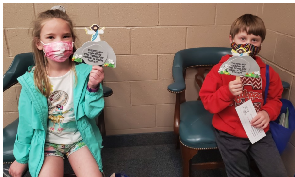
PSR 2nd Graders Make Resurrection Crafts

This past March, our eighth graders attended their Spirit Day retreat led by our Life Teen ministry. They had a wonderful day of reflection, as well preparing for their Confirmation. Life Teen did a tremendous job leading them in a day of prayer, skits, table discussion, a craft, adoration and reflection as they read cards from their loved ones. We are proud of the students with all the hard work they have put in this year as they await to become fully initiated members of the Church. Please continue to pray for all of our Confirmandi as well.