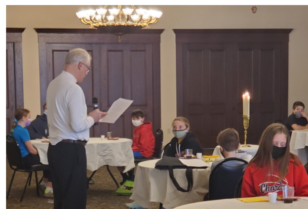
6th Grade PSR Celebrates the Seder Meal