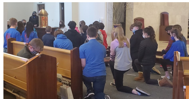
Adoration and Prayer at the Confirmation Retreat